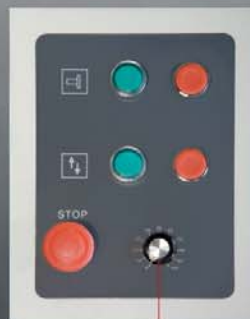
Stepless speed variation adjustment