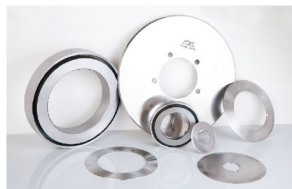
◆ Grinding Samples