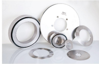
◆ Grinding Samples