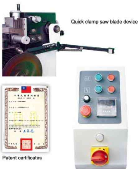
Quick clamp saw blade device