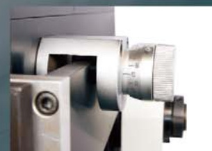
Saw blade chip breaker slot adjusting button 0.1-2.0 mm