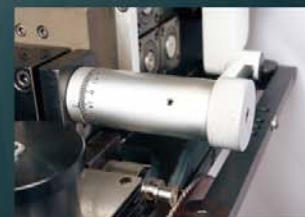
Grinding wheel left and right adjusting button